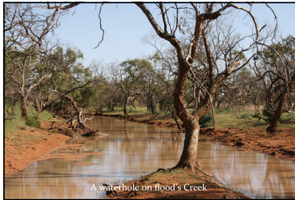
A waterhole on Flood's Creek

Flood rode ahead and discovered a good waterhole forty miles north on a creek ahead. Named Flood's Creek, they set up camp for a week. Meanwhile, Poole, Browne and Mack rode as far as the Queensland border in order to find further water supplies.