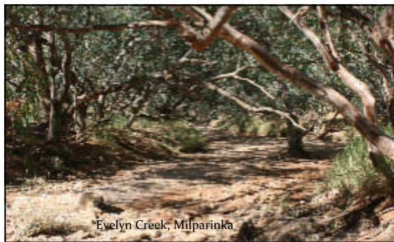
Evelyn Creek, Milparinka

Here they set up a more permanent camp. Sturt led a small party northwards, crossing the Queensland border to the west of the Grey Range and exploring far as the Wilson River before returning to the Evelyn Creek.