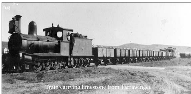
Train carrying limestone from Tarrawingee