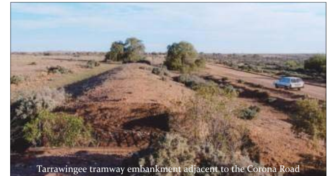
Tarrawingee tramway embankment adjacent to the Corona Road

Tarrawingee was a significant stepping-off point for travelers to centres such as Euriowie, Milparinka and Tibooburra in the north. Passengers would take the tramway to Tarrawingee where they were met by the Cobb and Co or Morrison coaches.