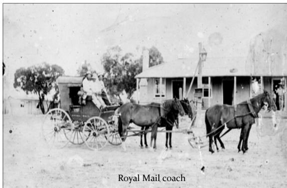
Royal Mail coach

In the early 1880s coach services were introduced, firstly to provide transport and mail from Wilcannia to the Albert Goldfields, and later to connect with other mining towns in the Barrier Ranges and Broken Hill.