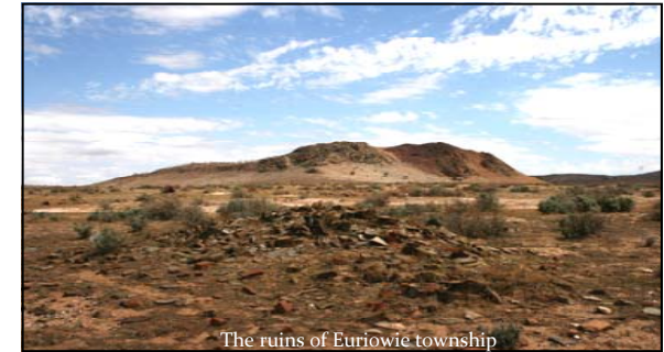
The ruins of Euriowie township

Of the hotels, only the Euriowie continued to function until the 1930s when it was abandoned. The post office closed about the same time.